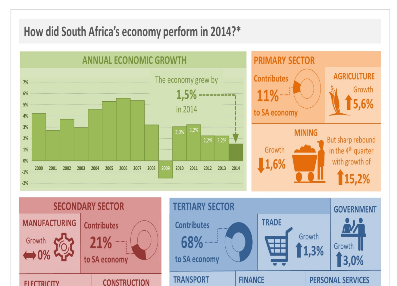
ECONOMIC OF FIGURE ANNUAL GROWTH SOUTH AFRICA

In order for a national minimum wage to be effective and remotely emulate what transpired in Brazil, South Africa requires a high level of economic growth. This would essentially support the notion of consumption-fuelled growth as presented by the proponents of the national minimum wage. South Africa however only showed a 1.5% economic growth rate in 2014 and this has relatively remained at low levels for the past 7 years (2008-2014) as depicted by the graph above.